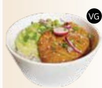
VG CHEEKEN TERIYAKI DON 75k