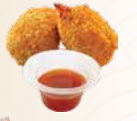
CRAB CLAWS 30k