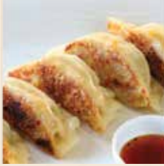
CHICKEN GYOZA 60k