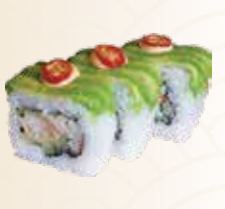
ROCK N ROLL 40k