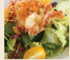
SOFT SHELL CRAB 65k