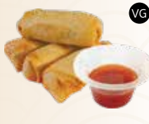
SPRING ROLLS 30k