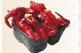
CHUKA IDAKO 25k