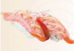
ABURI SALMON 40k