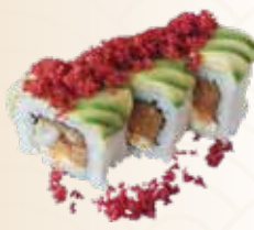
CHICKEN CRUNCH 35k