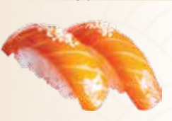
SALMON TERIYAKI 40k