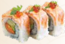
SEARED SALMON 40k