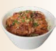
CHICKEN DONBURI (TERIYAKI OR KATSU) 67k