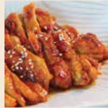
CHICKEN TERIYAKI 72k