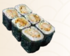
CHICKEN TERIYAKI 25k