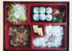
BEEF BULGOGI Beef Bulgogi, Rice, Salad, Cucumber Mini Roll