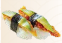
CHICKEN AVOCADO 25k