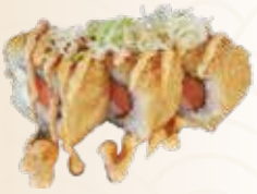
JB ROLL 35k