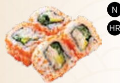
COOKED TUNA AVOCADO 30k