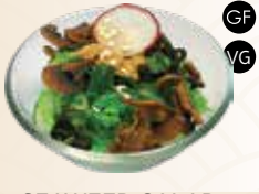
SEAWEED SALAD 25k