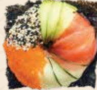
HINATA Salmon, Tuna, Cucumber, Avocado, Sesame, Tobiko, Cream Cheese