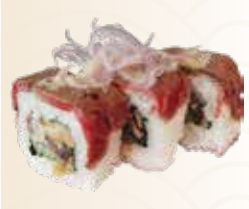
BEEF PONZU 40k