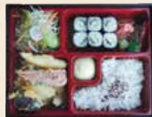
VEGE TEMPURA Vege Tempura, Rice, Salad, Avocado Mini Roll