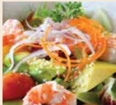
PRAWN AVOCADO 75k