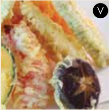
VEGETABLE TEMPURA 69k