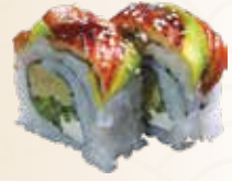
EEL CREAM CHEESE 45k