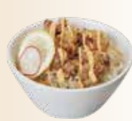
CHICKEN KARAAGE DON 69k