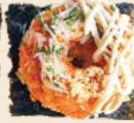
ASAHI Spicy Salmon, Spring Onions, Cream Cheese, Tempura Flakes, Mayonnaise