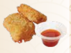
PRAWN KATSU 35k