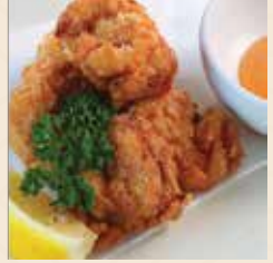
CHICKEN KARAAGE 62k