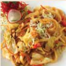
YAKI UDON 79k