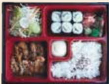
CHICKEN TERIYAKI Chicken Teriyaki, Rice, Salad, Avocado Mini Roll