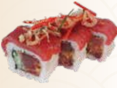
TUNA SAMBAL MATAH 35k