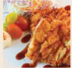
CHICKEN KATSU 75k