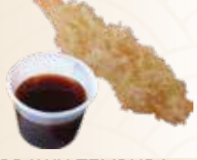
PRAWN TEMPURA 30k