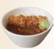
CHICKEN KATSU CURRY 72k