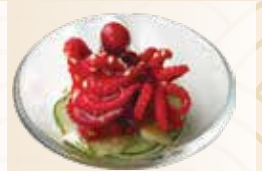
CHUKA IDAKO SALAD 25k