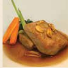
TUNA STEAK 95k