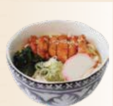
CHICKEN UDON 91k