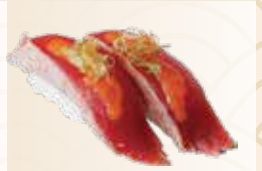
TUNA TATAKI 35k