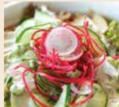
CHICKEN & PEAR 63k