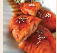
SALMON TERIYAKI 120k