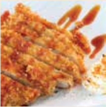
TONKATSU PORK 95k