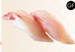
KING FISH 30k