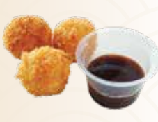
CRAB CROQUETTES 30k