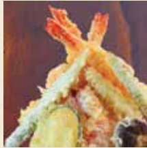
MIX TEMPURA 89k