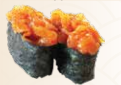
JELLY FISH 25k