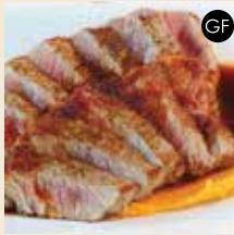
WAFU STEAK 140k