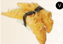
TEMPURA PUMPKIN 20k