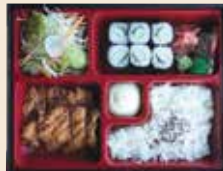
CHICKEN KATSU Chicken Katsu, Rice, Salad, Cucumber Mini Roll