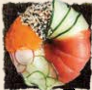
RIKO GF Tuna, Avocado, Cucumber, Tobiko, Radish, Sesame