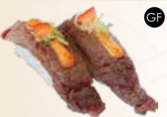
SEARED BEEF 35k