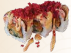
SALMON CRUNCH 35k