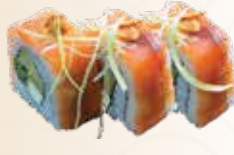
SMOKED SALMON 40k