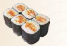
SPICY SALMON 40k