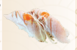
ABURI KING FISH 35k