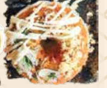
SORO Spicy Tuna, Cream Cheese, Tempura Flakes, Mayonnaise, Onions