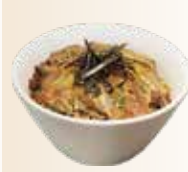
TONKATSU DON 79k