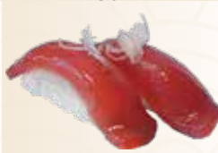
TUNA TERIYAKI 30k