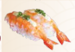
SEARED GARLIC PRAWN 40k