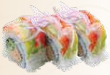
PRAWN AVOCADO 35k

Prices are Subject to 10% Tax & 6% Service Tax