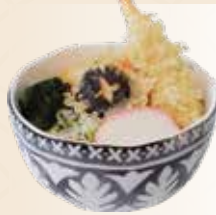
TEMPURA UDON 95k