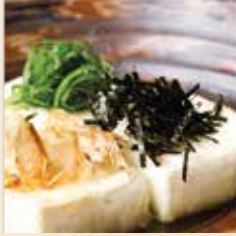
AGEDASHI TOFU 58k