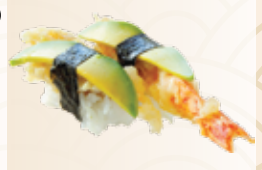
TEMPURA PRAWN 40k