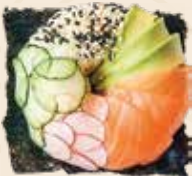
HARUTO Salmon, Cucumber, Cream Cheese, Avocado, Sesame, Radish