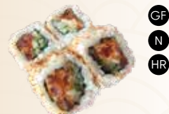
GARLIC SOFT SHELL CRAB 35k